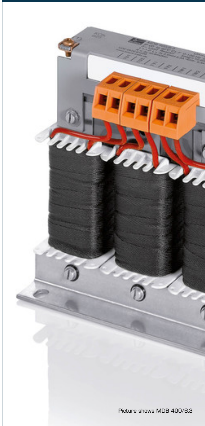
Picture shows MDB 400/6,3